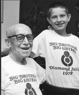
IRV WESTHEIMER: America's First Big Brother

Create and support one-to-one mentoring to ignite the power and promise of youth.