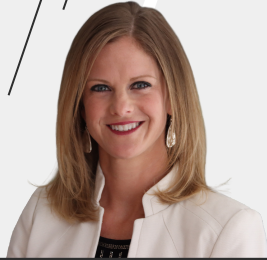
2024 EXECUTIVE BOARD CHAIR

While we reflect on the successes of 2023, we know there is more to be done. There are more families to reach on our waiting list, more PARTNERSHIPS to build, more Bigs to recruit, and more stories to share. We look forward to 2024 and partnering with you, our donors and volunteers. We will continue our work so that each child in our program dreams bigger, achieves more, avoids risky behaviors, and achieves educational success. We may implement new programs and strategies, but the unwavering focus on our mission remains: empowering every child to graduate with a plan for their future and a mentor whose impact lasts a lifetime. TOGETHER we can do BIG things.