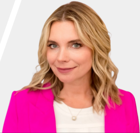
PRESIDENT & CEO